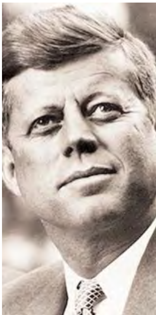
J.F. Kennedy in 1962.

American air space. But with the help of the US government, the Soviet Communists suddenly had ballistic missiles with nuclear payload capabilities parked just 90 miles south of Key West, Florida. Thus, the technologically-primitive Soviet military of 1960 was instantly “brought up to speed” by its pretended adversary, the