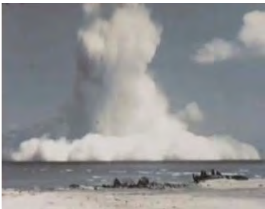
Mushroom cloud of an explosion HARDTACK.

The call for a test ban figured repeatedly in disarmament discussions, most importantly, those of the Disarmament Subcommittee of the U.N. Disarmament Commission, in session from 18 March to 6 September 1957. Continuing pressure on the nuclear powers to reach an agreement on limiting testing resulted in the Conference on Discontinuance of Nuclear