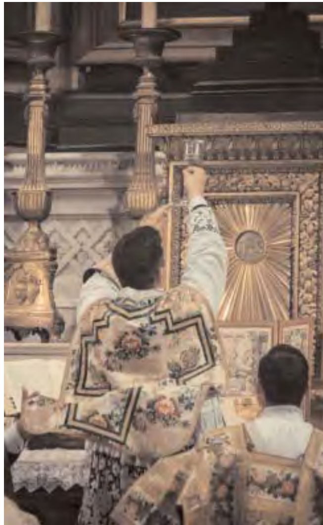
The Holy Sacrifice of the Mass.

But Roncalli’s betrayal of the council fathers was to be glossed over almost as soon as it happened by his re-introduction onto the world stage as the great “peacemaker” and negotiator for ending the Cuban Missile “Crisis”, further reinforcing the title bestowed upon him by the controlled media: “Good ‘Pope’ John”. Obviously coached by his handlers and press agents, Roncalli proposed first to the Kremlin, then to Washington that The