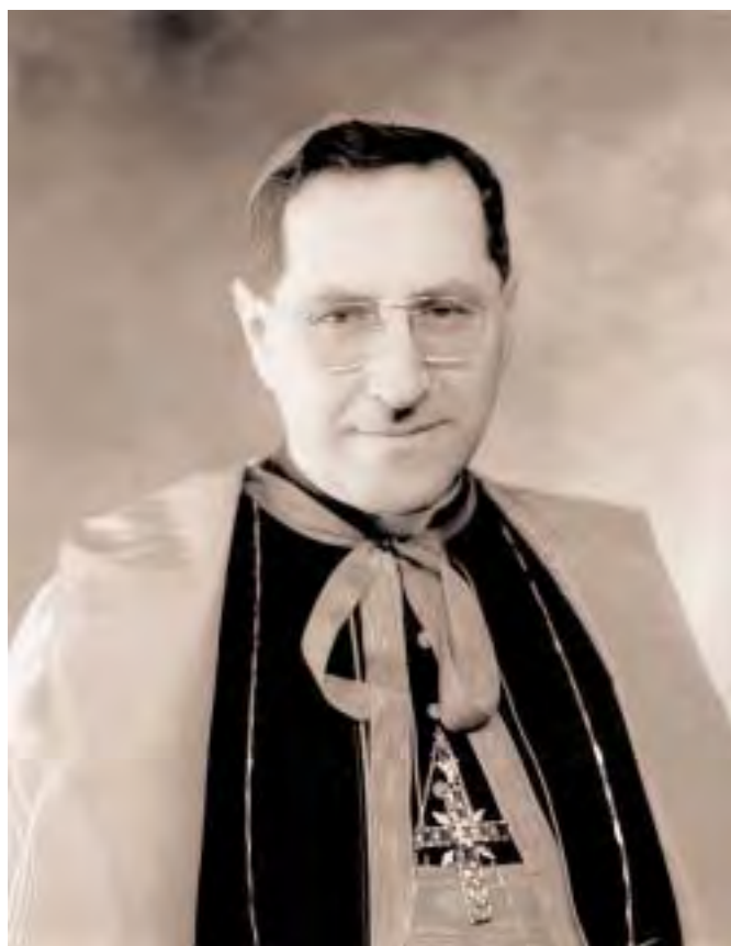
Giuseppe Siri in 1955.

Although conducted within the enclosed chambers of the papal conclave, the earlier election of the new pontiff on 26 October 1958 was almost immediately apparent to the outside world due to the white