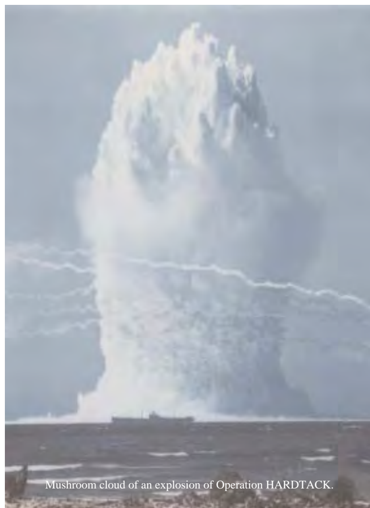
Mushroom cloud of an explosion of Operation HARDTACK.