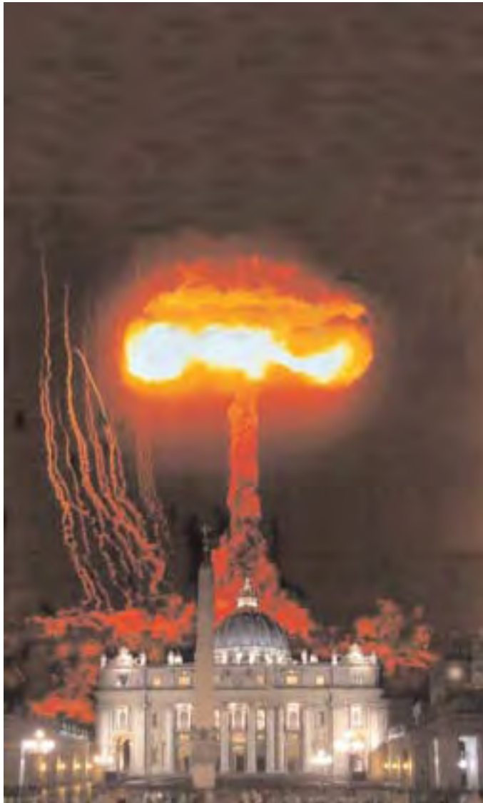
Was the threat of an atomic bomb on the Vatican used to force Joseph Siri off the Chair of Peter?

«Why do we not bomb Rome? Why do we allow these open and declared antagonists of democratic freedom to entertain their Shinto allies and organize a pseudo-