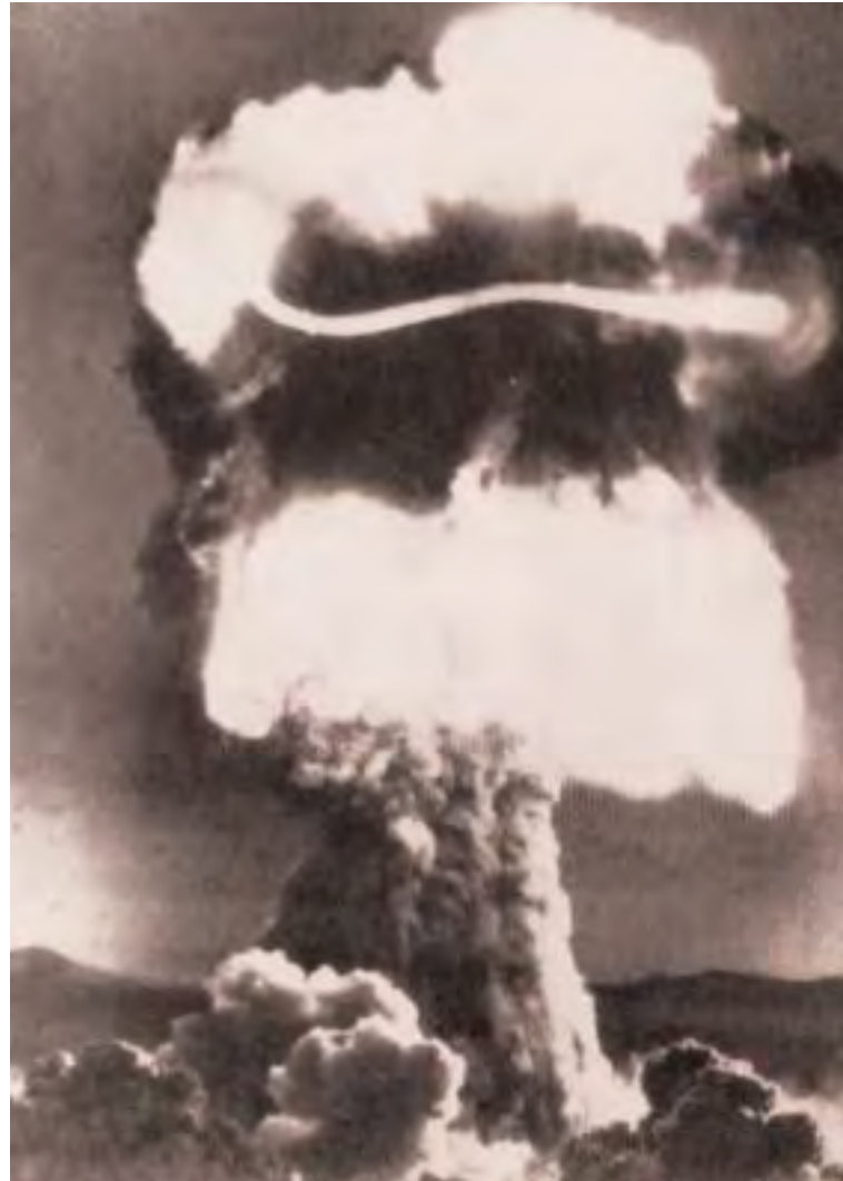
The mushroom cloud of the explosion of the bomb dropped on Hiroshima.

«It was February 1988. Two 30 Days reporters were on